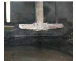
Mixer blade protection