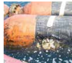
Floating hose repair